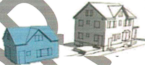
Example of Detached ADU.